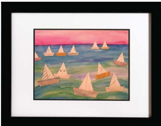
Teacher-Prepared Sample Artwork in KidsArt Fairs Gallery-Style Frame