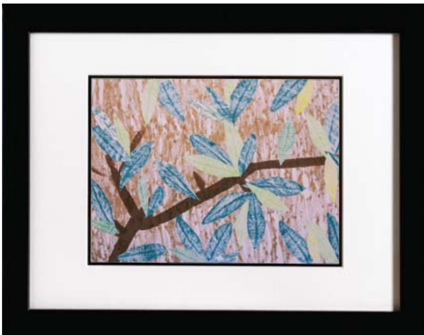
Teacher-Prepared Sample Artwork in KidsArt Fairs Gallery-Style Frame

For this example, the background is the bark rubbing; leaves are cut from leaf rubbings and paint impressions; branch is painted with tempera paint.