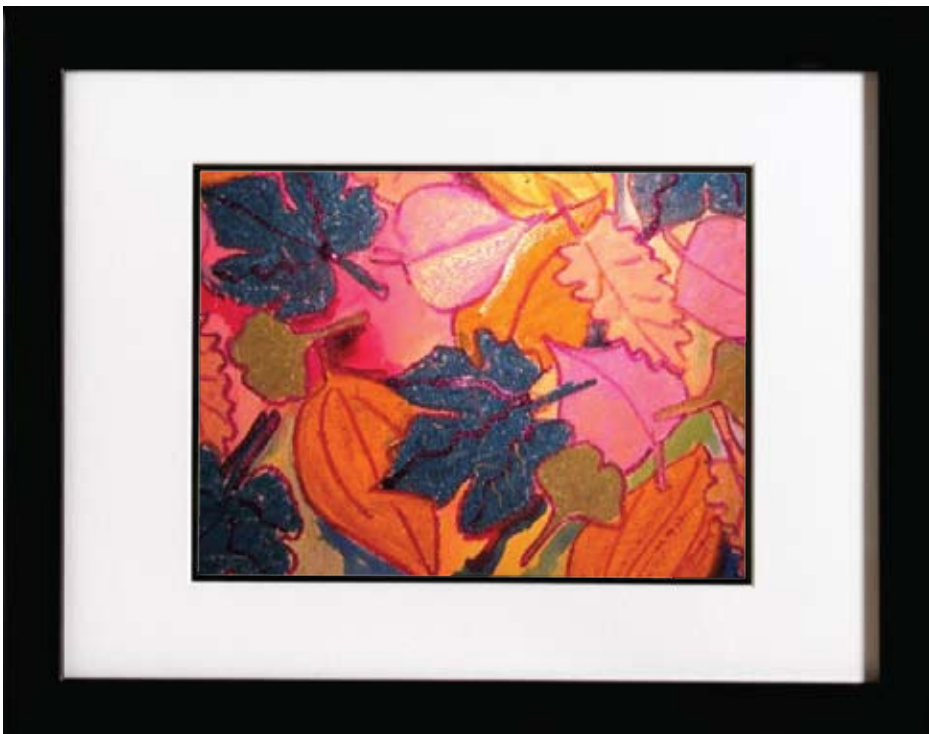
Teacher-created sample picture in KidsArt Fairs gallery-style frame.