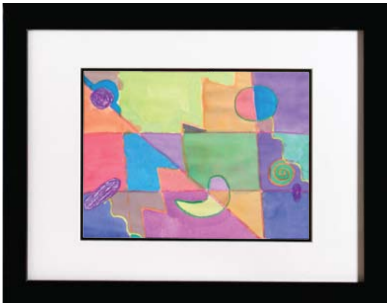
Teacher-Prepared Sample Artwork in KidsArt Fairs Gallery-Style Frame