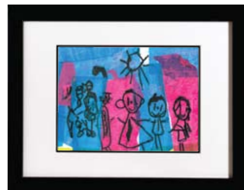
Samples of "Me and My Family" artwork created by Pre-K students in KidsArt Fair gallery-style frames.