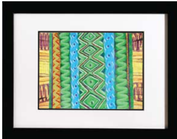
Teacher-Prepared Sample Artwork in KidsArt Fairs Gallery-Style Frame