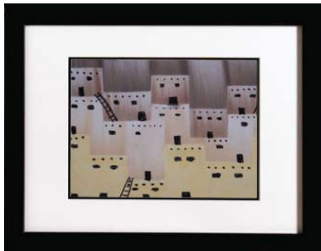
Teacher-Prepared Sample Artwork in KidsArt Fairs Gallery-Style Frame