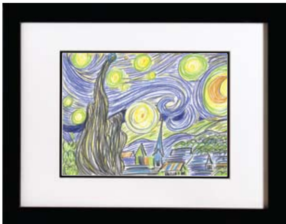
Colored pencil on KidsArt Fairs paper canvas in gallery-style frame.