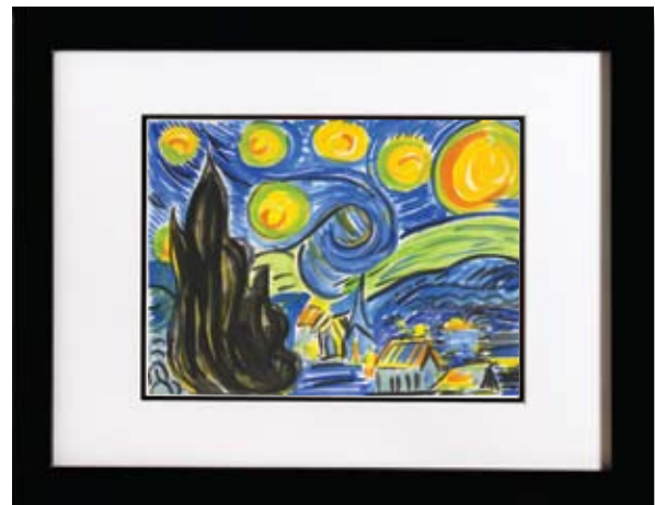
Watercolor on KidsArt Fairs paper canvas in gallery-style frame.