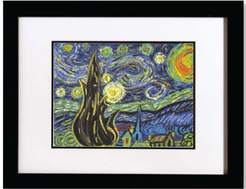
Oil pastel on black paper mounted on KidsArt Fairs paper canvas in gallery-style frame.

Allow enough time for students to share their artwork with the class, discussing how they used color and line to express emotion in their pieces.